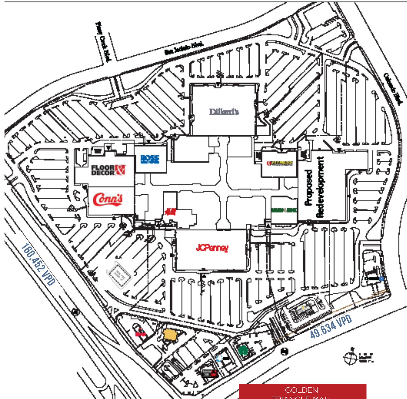
GOLDEN TRIANGLE MALL